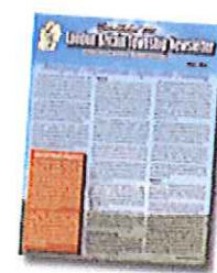
Download the latest Township Newsletter