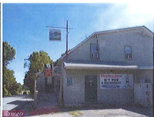
Accuracy Issue Photo Date: 9/2004